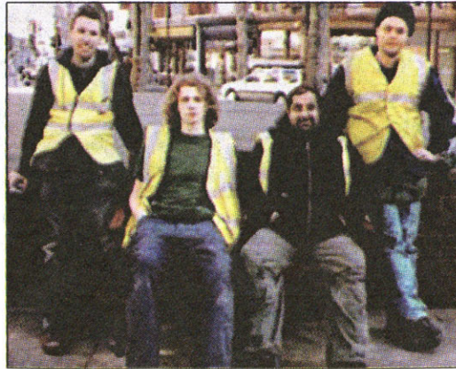
On the bench: the "Guerrilla Benchers" arrive in the West End with a new seat, drill the holes for the holding bolts, right, and put their work to the test, left